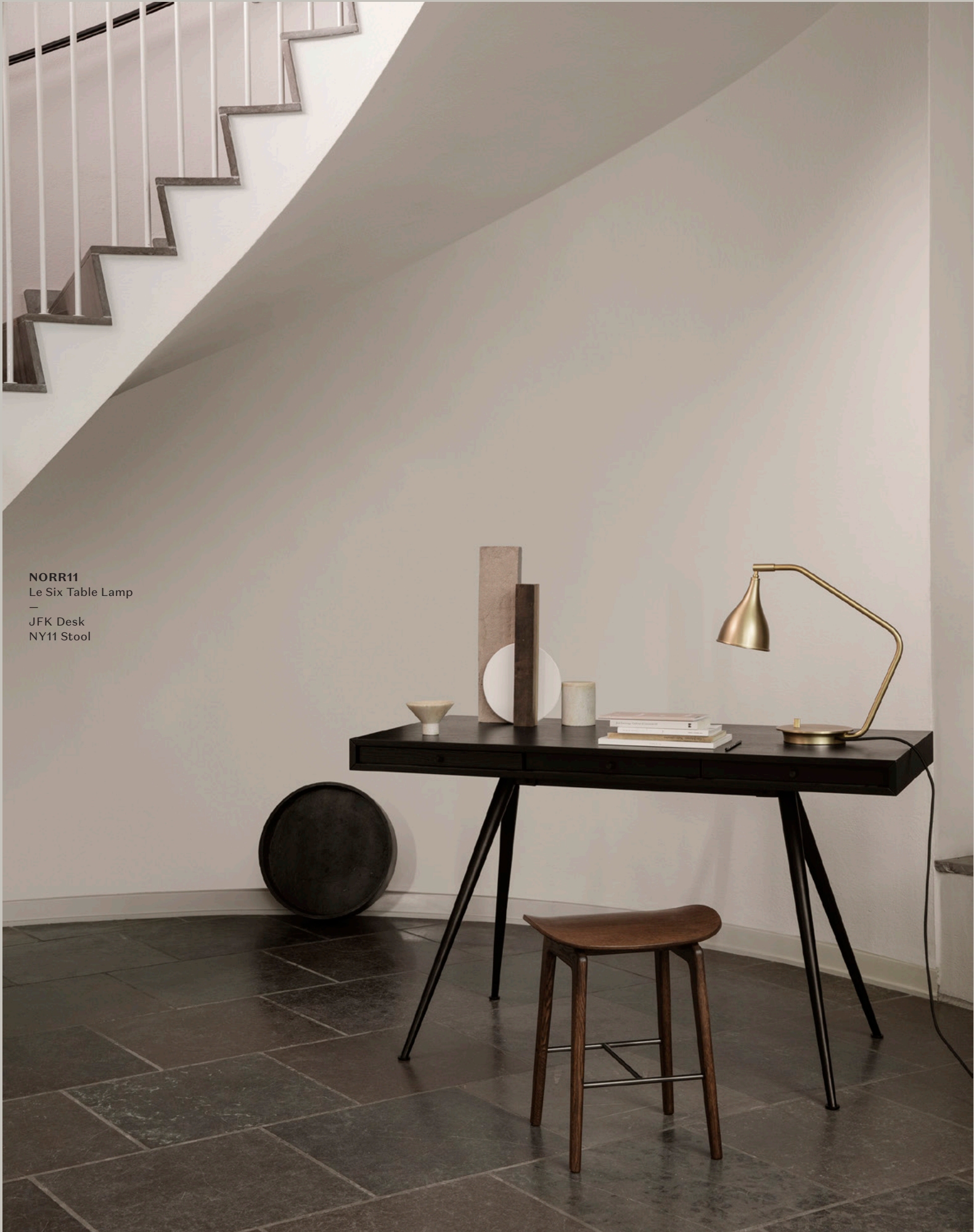
NORR11 Le Six Table Lamp — JFK Desk NY11 Stool