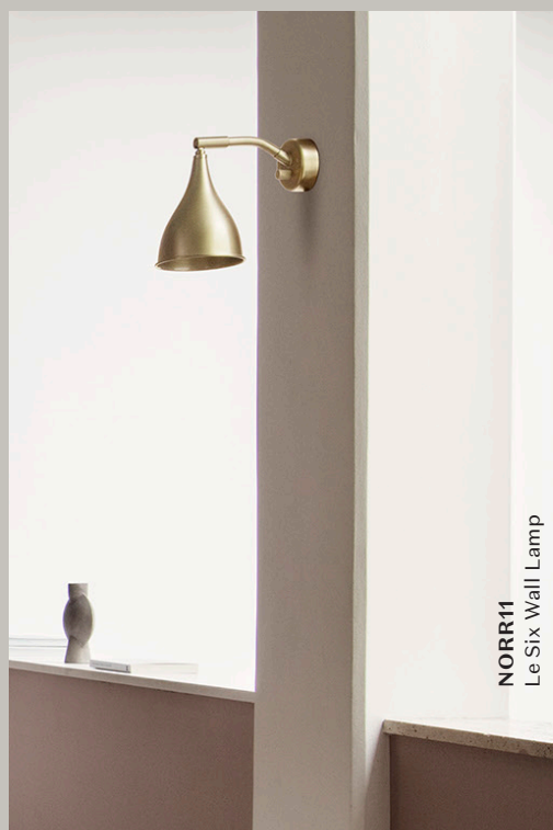
NORR11 Le Six Wall Lamp