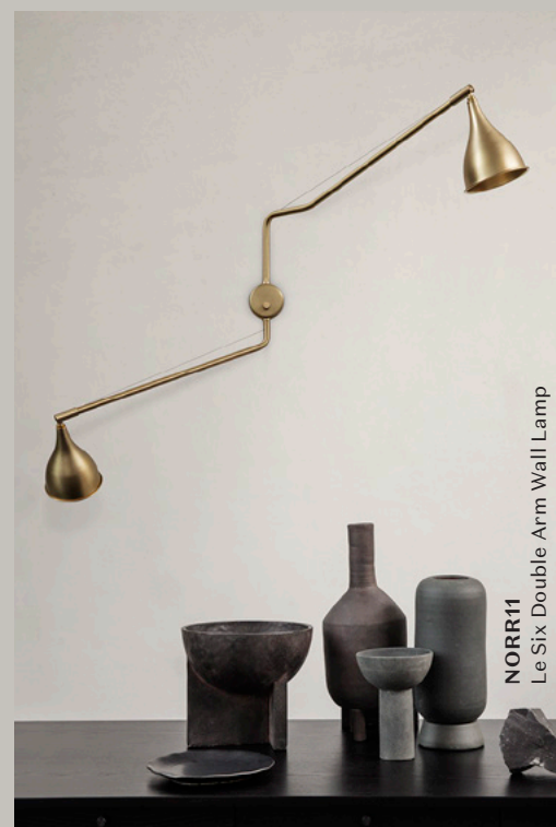
NORR11 Le Six Double Arm Wall Lamp