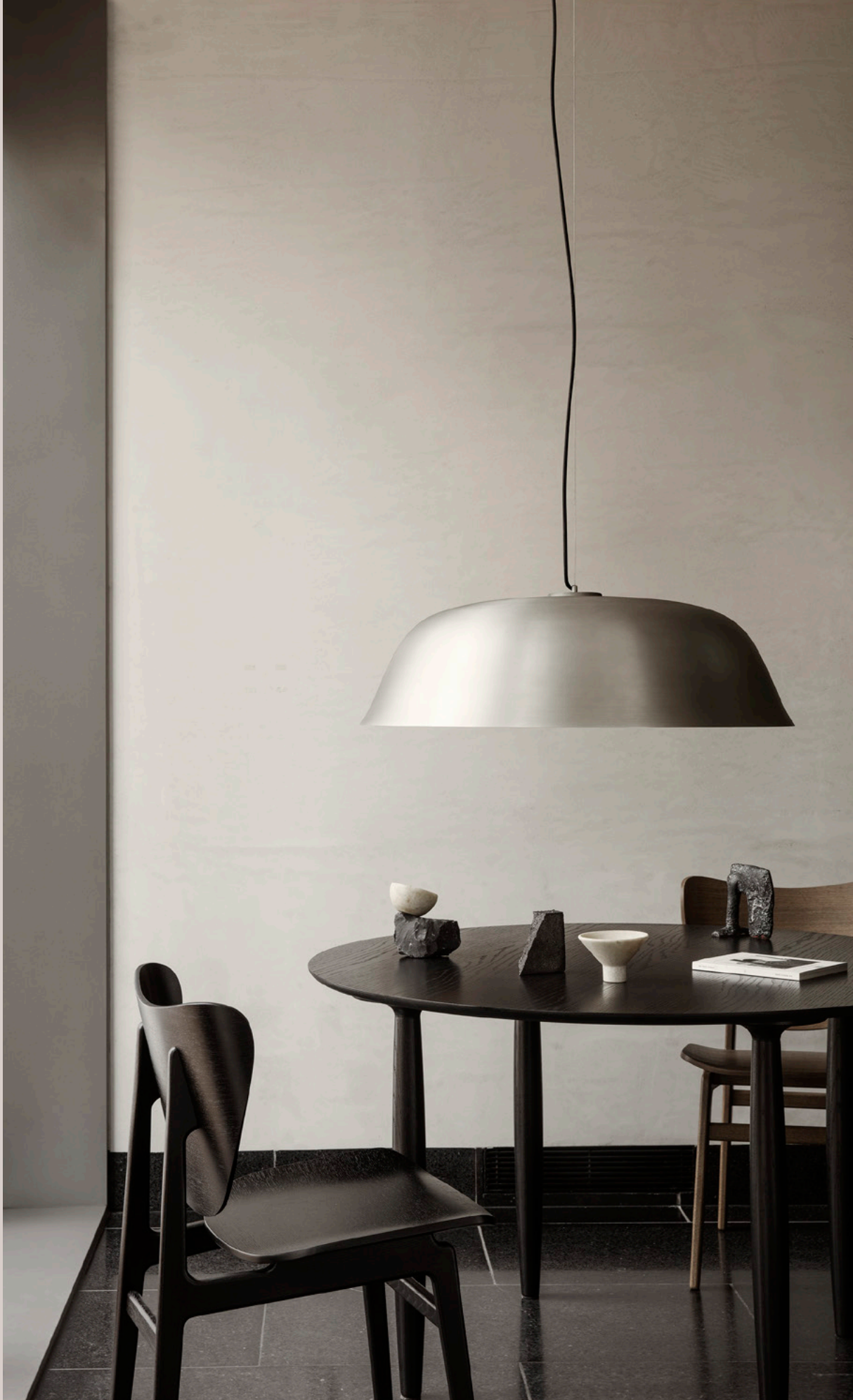
NORR11 Cloche Three Pendant Lamp — Oku Dining Table Elephant Dining Chair