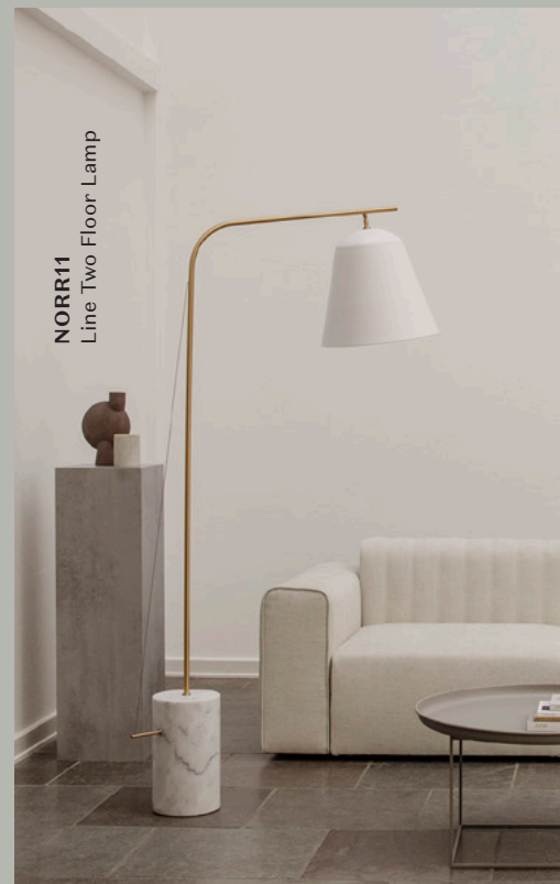
NORR11 Line Two Floor Lamp