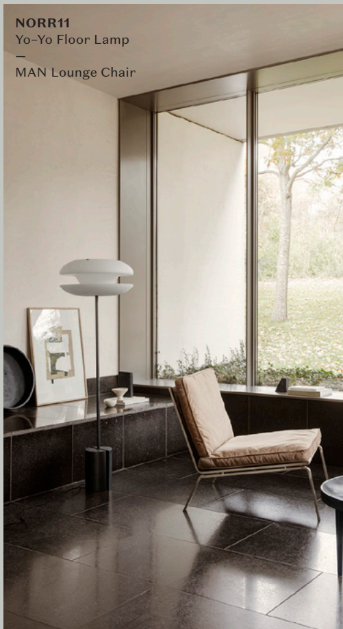
NORR11 Yo-Yo Floor Lamp — MAN Lounge Chair

Inspired by the concentric shapes of a Yo-Yo, the Yo-Yo lamps are characterized by two circular opal glass shades placed opposite each other creating different layers to obscure the light source. A single layer glass ensures a bright illumination of the ceiling, while a double layer glass creates a warm and inviting atmosphere below the lamp. The translucent lampshades is elegantly mounted in an industrial metal fixture.